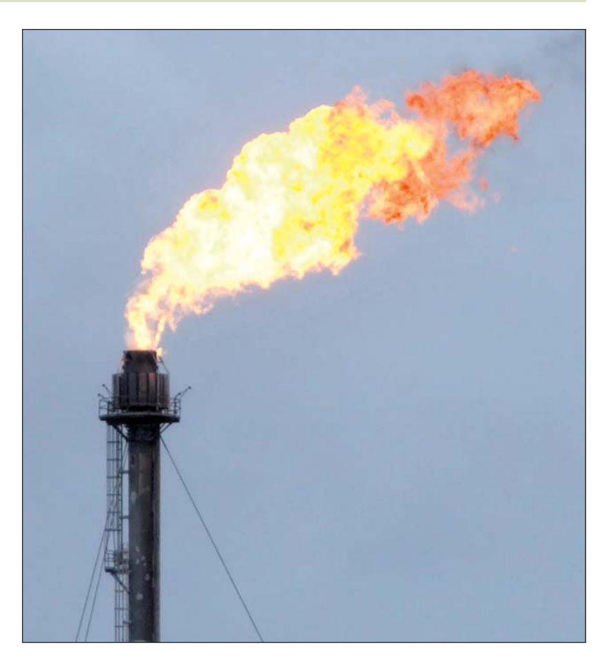
If Synthetic Biology allows the oil and gas industry to make economic use of "stranded" gas that will increase revenues from coal seams, oil fields and fracking operations. Photo of gas flare (cc) Kristian Dela Cour

Texas. In an interview about REMOTE, The focus of the Gonzalez explained that the REMOTE program is technologies the program intends to to develop the means to produce are particularly applicable to capture "stranded gas" the booming fracked gas market, since they, "will support natural gas from fracking and other bioconversion facilities with low oil and gas extraction capital cost and at small scales, which in turn would enable the use of any natural gas resource, including those frequently flared, vented or emitted."45